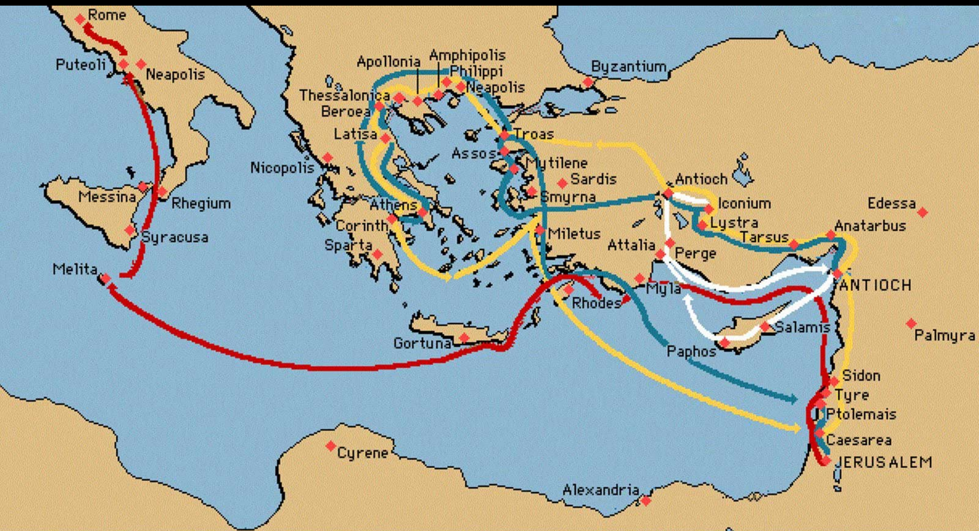
← Paul's First Journey ← Paul's Second Journey ← Paul's Third Journey ← Paul's Journey To Rome